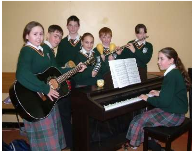
First Years getting their Act together before the Christmas Show.

St. Ailbe's held a Christmas concert just before our holidays and all students were welcome to play an instrument, sing a song or take part in a play. It was a nice end to the term and all enjoyed the show.