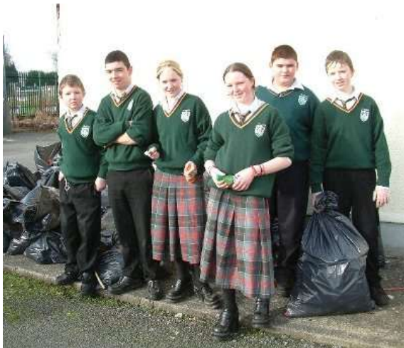
First Years who took part in the Litter Blitz about the school and around the local housing estates.

First Years having completed a Local Clean-up in school and the adjoining local community .