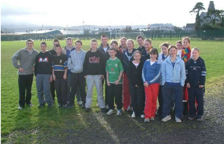
The students who helped in running the Easter Camp.