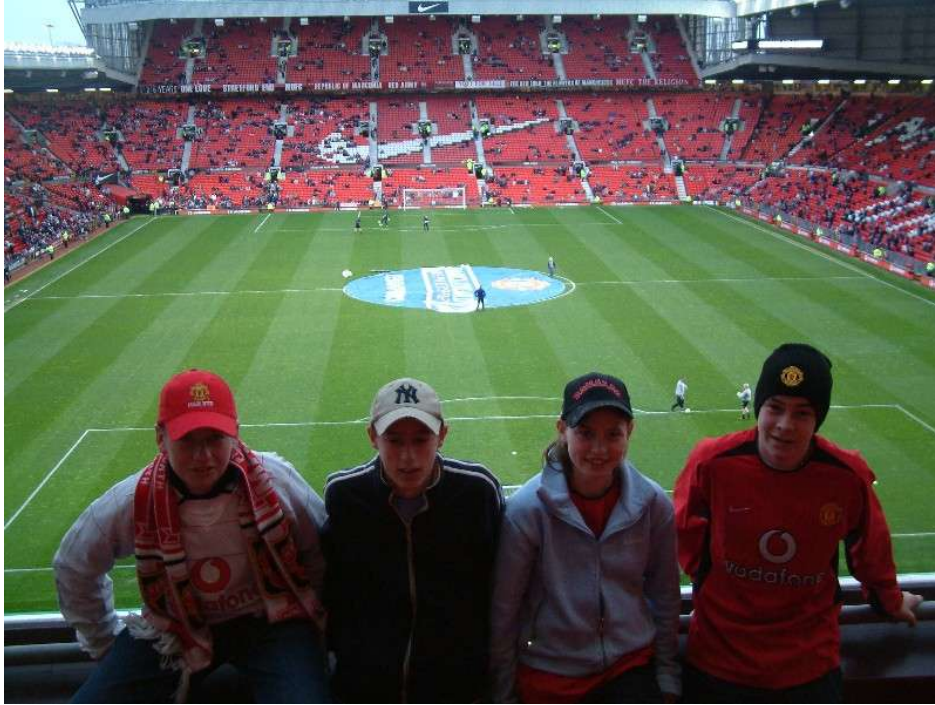
Just before kick-off

A very enjoyable and memorable trip was had by all and of our four previous trips across to see the premiership, it was probably the best. The question which was on all pupils lips on the way home was 'Can we go there again next year?'