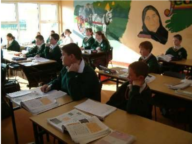
An chéad Bhliain sa rang Gaeilge.

Uibheacha Cásca do na buaiteoirí go léir.